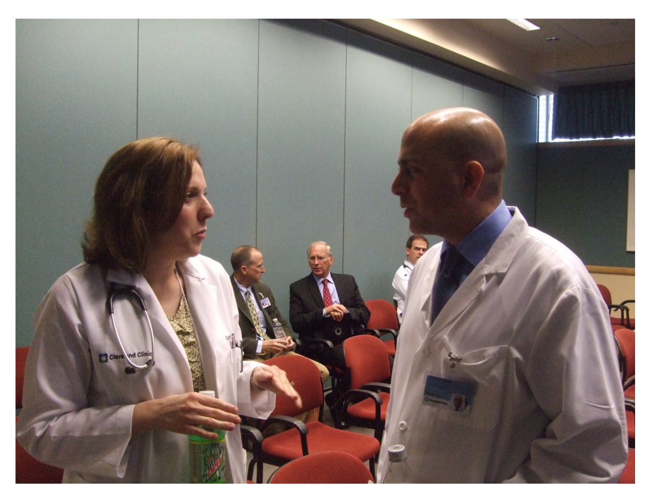
Discussions after the grand rounds