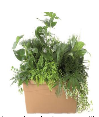
Rectangular plant composition pot