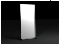
back wall picture