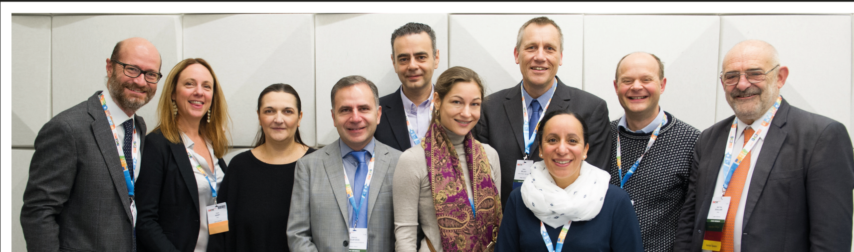
The Joint ESMO-SIOPE Working Group on Cancer in Adolescents and Young Adults (AYA)

The implementation of the Joint ESMO/SIOPE AYA Working Group demonstrates the dedication of Europe's leading societies for Medical and Pediatric Oncology to jointly improve care and outcomes for the AYA population.