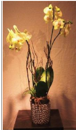
yellow Orchid € 115,24