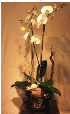
white Orchid € 146,67