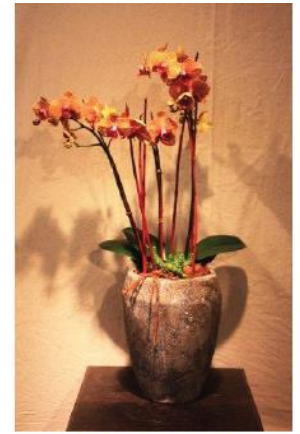
salmon Orchid € 115,24