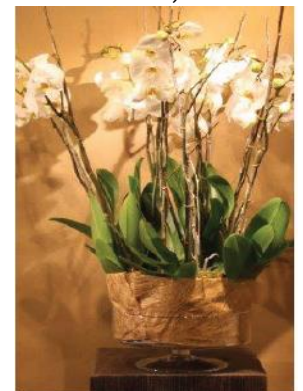
white Orchid € 366,67