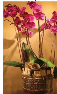
pink Orchid € 230,48