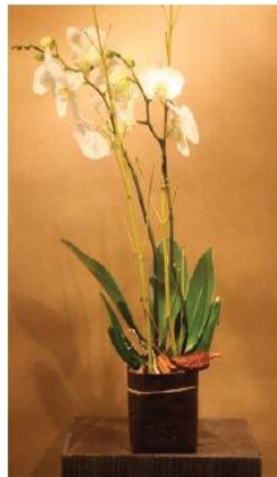
white Orchid € 115,24