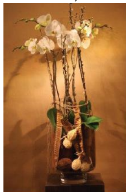
white Orchid € 188,57