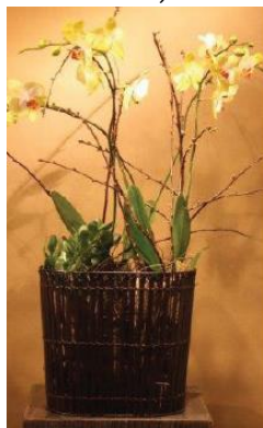
yellow Orchid € 230,48