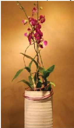
dendro pink Orchid € 115,24