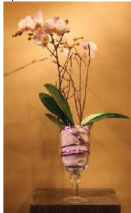
pink Orchid € 115,24